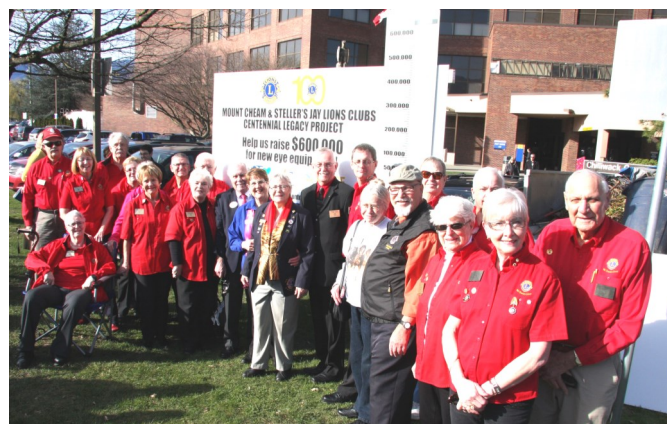
Above: Lions from various clubs at the sign unveiling. Below: The Steller's Jay Lions donated $5,000 to the Centennial Legacy Project at their January meeting.