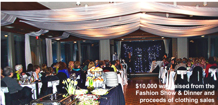
$10,000 was raised from the Fashion Show & Dinner and proceeds of clothing sales

We are getting closer to a replacement bus in Hope! You can help Hope get that bus by making your tax deductible gift online at www.FVHCF.ca !