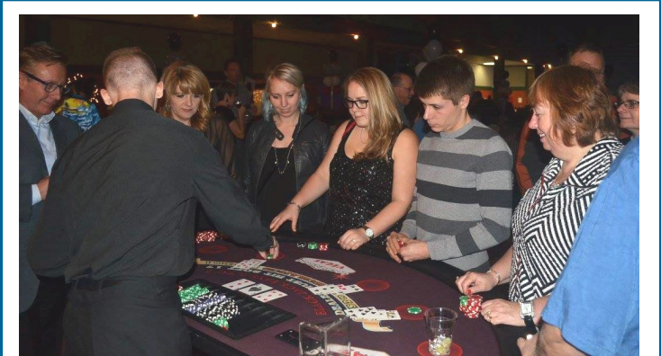
Rotary Club of Chilliwack-Fraser held its Swing into Spring dance on Feb. 20. The theme was It's Vegas, Baby! complete with game tables and glitz! Funds raised will go to the Pediatric Observation Unit at Chilliwack General Hospital.