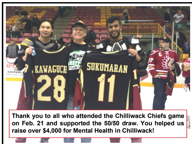
Thank you to all who attended the Chilliwack Chiefs game on Feb. 21 and supported the 50/50 draw. You helped us raise over $4,000 for Mental Health in Chilliwack!

Abbotsford 604-851-4890 Toll free 1-877-661-0314 Chilliwack 604-701-4051 info@FVHCF.ca Mission 604-814-5190