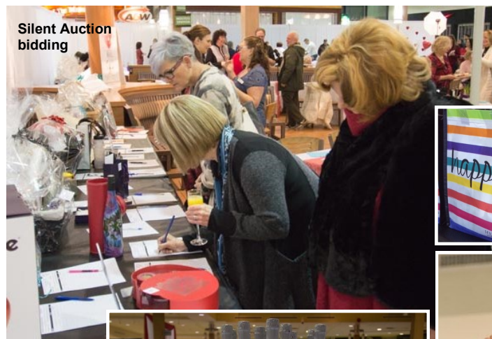
Silent Auction bidding